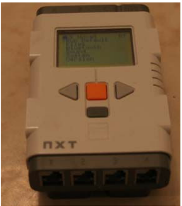
Fig. 2 NXT Intelligent brick