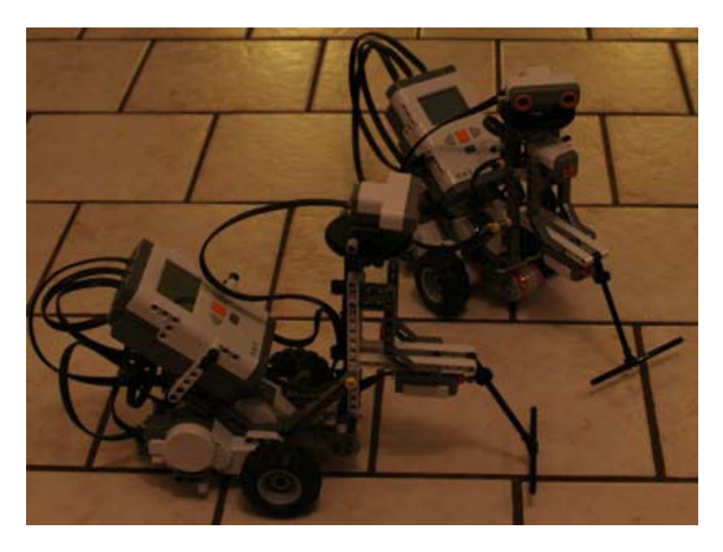
Fig. 1 Two assembled Lego NXT mobile robots