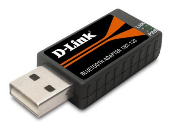
Fig. 6 D-Link DBT-120 Bluetooth adapter [20]