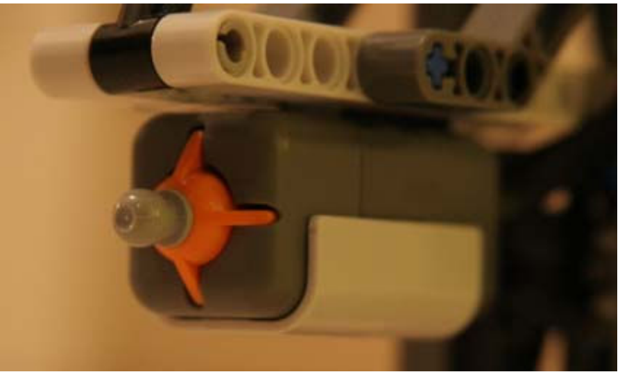
Fig. 4 Touch sensor of NXT